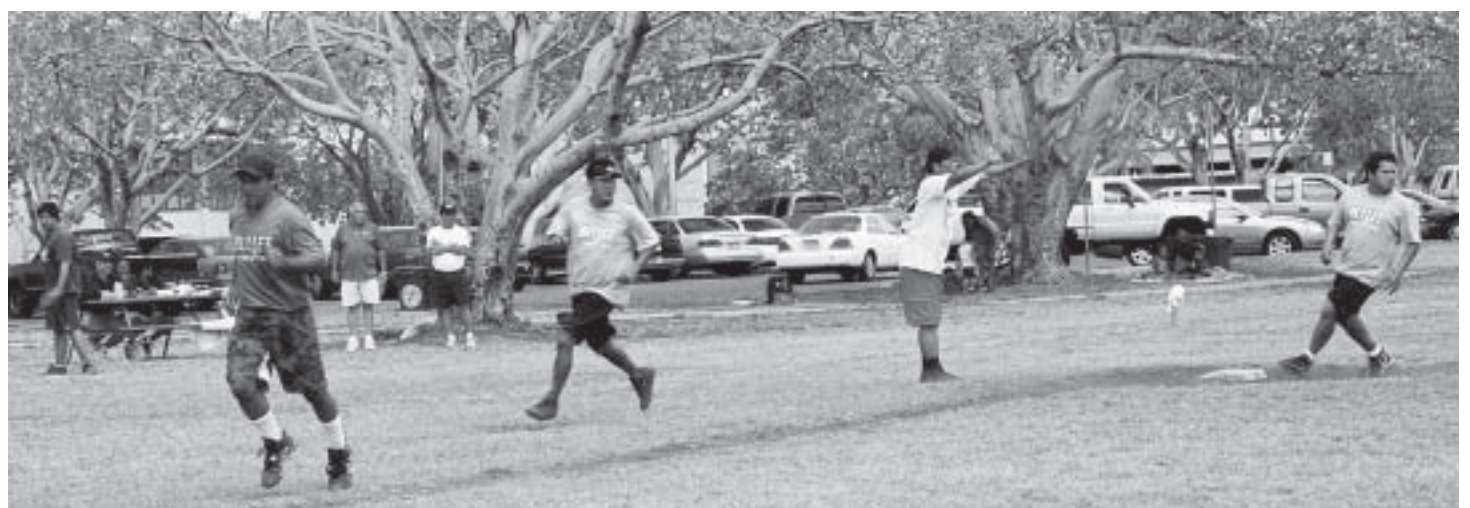
A stand-up triple means two runs heading home for Maui’s “Bullet Proof” in the round-robin championship game.