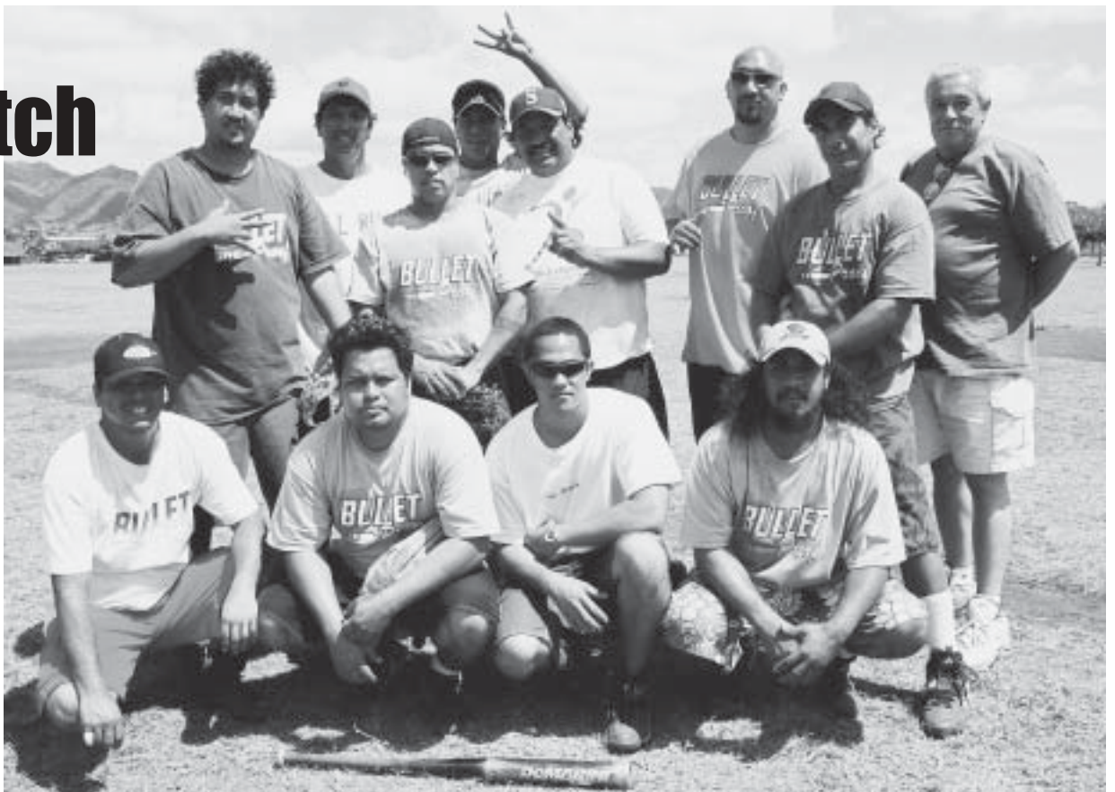
Maui’s team “Bullet Proof” took the state slow pitch championship in a tight game against the Big Island’s Mauna Lani Resort. Maui also won the 2001 state slow pitch tournament held on Kauai.