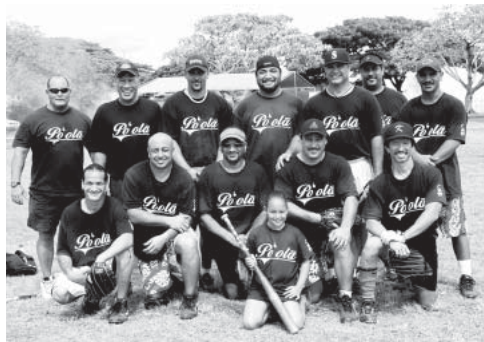
Oahu’s team from McCabe, Hamilton & Renny was called “Po’ola,” (lit. sun head ) which means “stevedore” in Hawaiian. Oahu took runner-up honors by edging out Mauna Lani by one run.