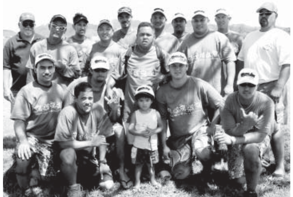
Mauna Lani Resort suffered tough losses—first by only one run against Oahu and then by two against Maui. Team members hail from Unit 1516 - Mauna Lani Resort and other ILWU hotel units on the Kohala coast.