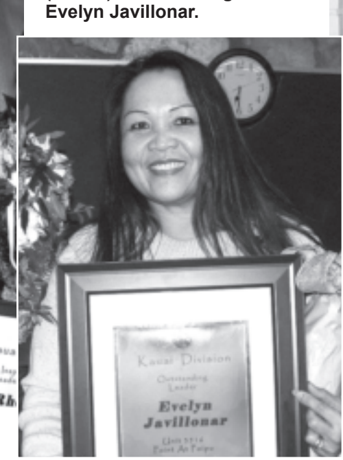
Look for more unit recognition award winners from other Divisions in the March/April issue of the VOICE of the ILWU