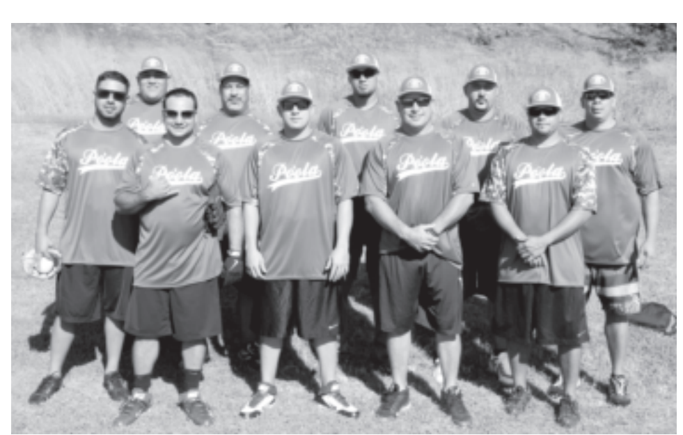
Third Place Team Award – McCabe, Hamilton & Renny Co., Poola.