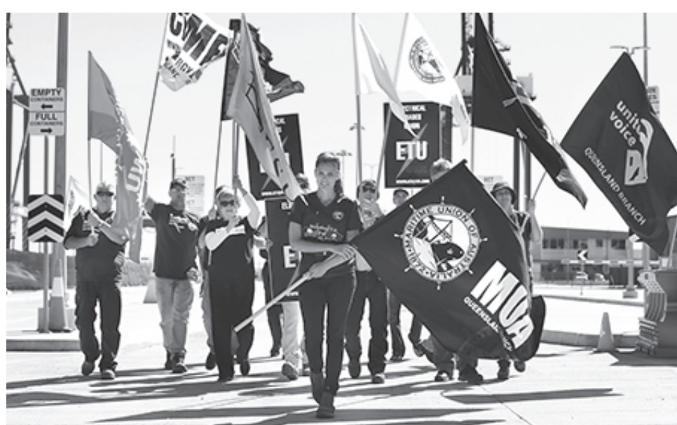
Dare to struggle, dare to win: After learning via text and email they were being sacked, Maritime Union of Australia dockers took action and won their jobs back in a struggle over automation.

Crumlin thanked affiliates of the ITF and IDC (International Dockworker Council) for their solidarity to help the sacked workers during the past three months.