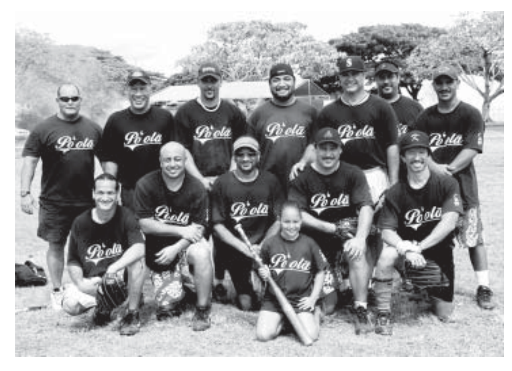
Oahu's team from McCabe, Hamilton & Renny was called "Po'ola," (lit. sun head ) which means "stevedore" in Hawaiian. Oahu took runner-up honors by edging out Mauna Lani by one run.