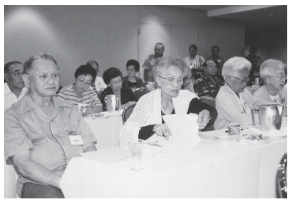
Attentive pensioners learn about issues important to Hawaii's elder citizens. Hawaii's economy was beginning to