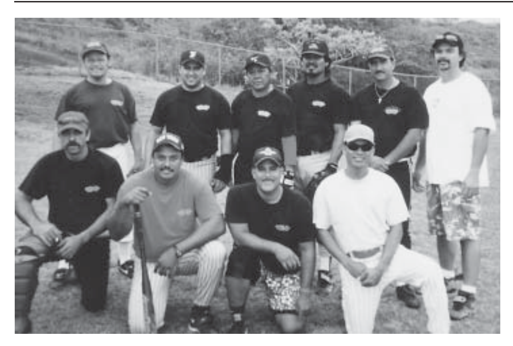
47th Annual ILWU Men's Fast-Pitch Softball champs "Sons of Kauai."