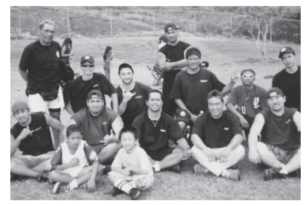
"Honolulu Advertiser" represented Oahu Division in the fast-pitch tournament.

Sponsored by the Hawaii State AFL-CIO and Hawaii's unions