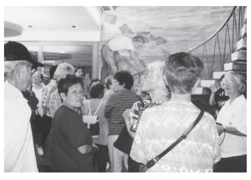
After the second day's session, retirees walked over to the ILWU building on Atkinson Drive to see the restored ILWU mural, "Solidaridad Sindical."

Neighbor island pensioners returned home with fond memories of Oahu and their old and newfound friends, especially grateful for the hospitality extended by all the Oahu pensioners and FTO's. One and all are looking forward to an even better conference on Maui in 2004.