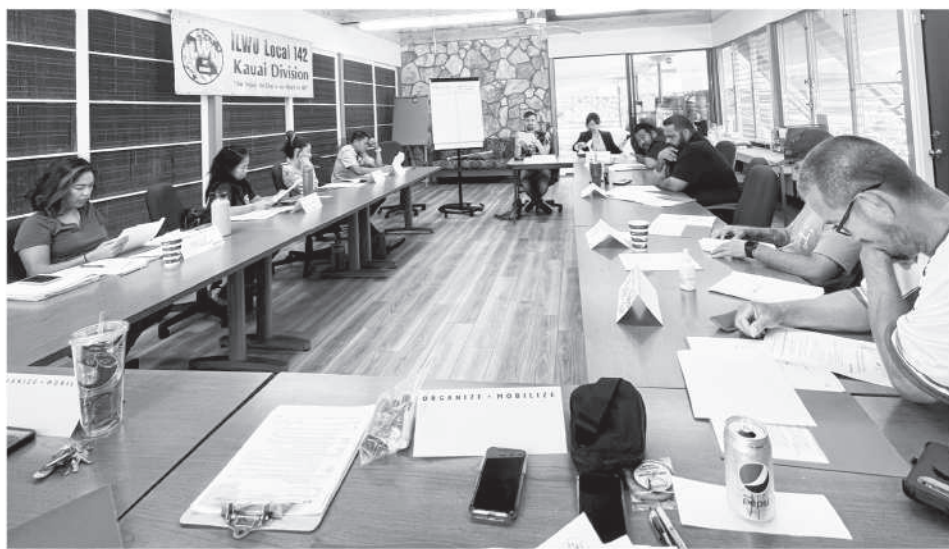
Kauai Division held their new steward training on June 28, 2022. New stewards came from units such as Wilcox Hospital, Gay & Robinson Power Plant, The Point at Poipu, Mid Pac Auto Center, Grand Hyatt Kauai, and Puakea Golf.