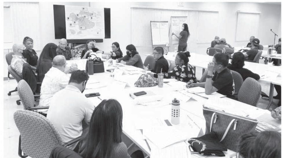
Maui Division held their new steward training on June 15, 2022. Nearly 20 new stewards attended from Wailea Golf, Valley Isle Federal Credit Union, Paradise Beverages, Hale Makua, Westin Maui, Kaanapali Beach Hotel, Montage Kapalua Bay, Wailea Ekahi AOA, Hyatt Regency Maui, Hotel Wailea, Grand Wailea Resort and Spa, Maui Beach Hotel, and Kaanapali Ali'i.