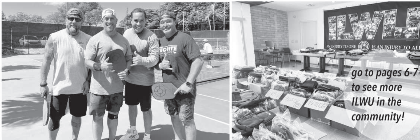
HONOLULU – over 100 members from Young Brothers, Matson, McCabe, Hamilton & Renny, and Hawaii Stevedores Inc. participated in a Longshore Pickleball Tournament on July 31, 2022 at Diamond Head Tennis Courts. This event was held on a weekend, with food and fun for the whole family, but it also raised a serious amount of money. Entry and participation fees went 100% toward filling over 400 backpacks with school supplies such as folder paper, notebooks, watercolors, pencils and markers. Way to go our brothers and sisters in Longshore for making this a win-win for all!